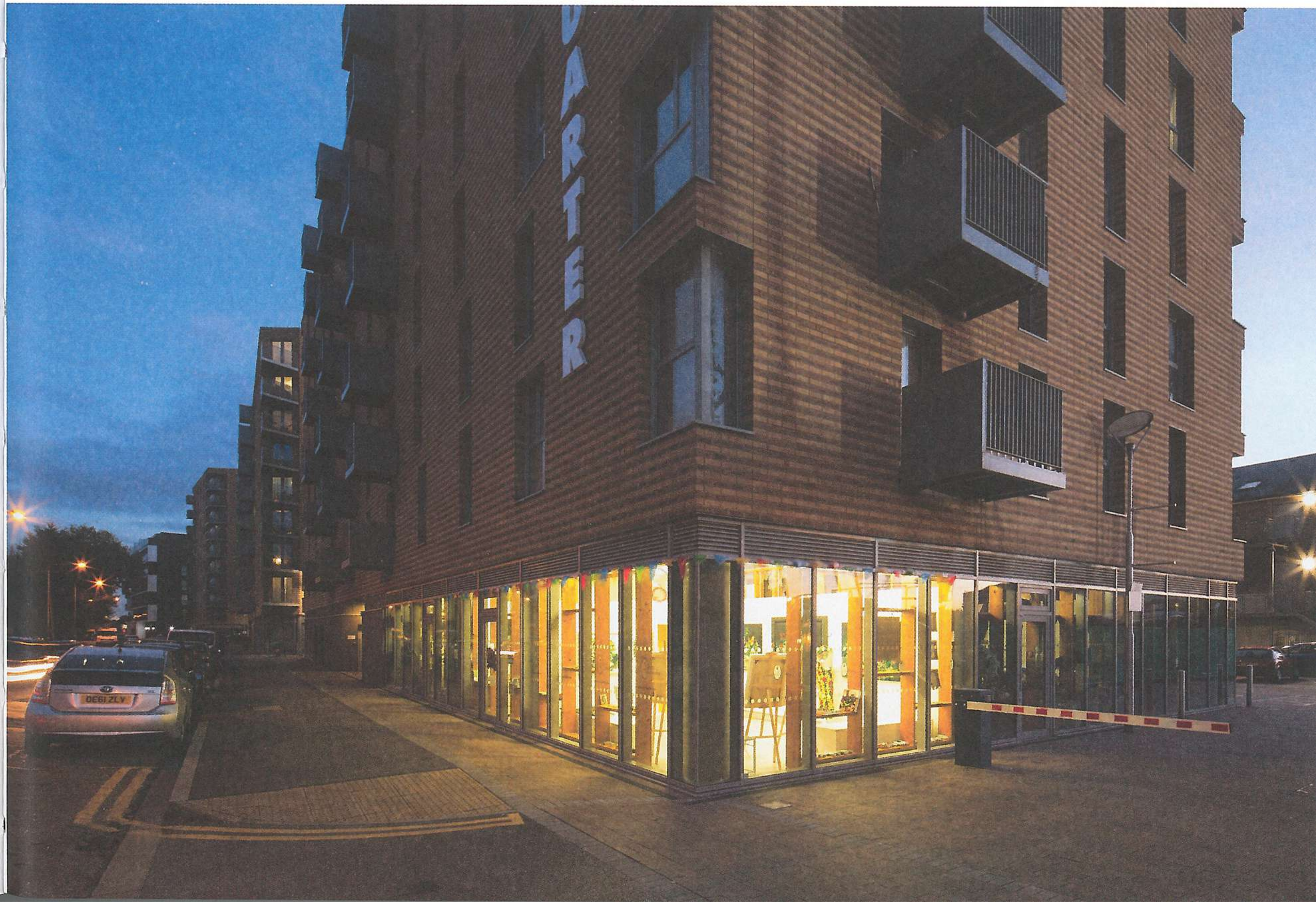
→ The studios are based in the new Ice House Creative Quarter in Barking, London.